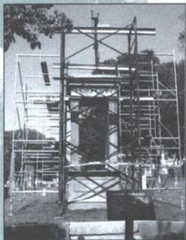
Scaffolding surrounds the McHenry Monument as it receives a major restoration.

JUST A YEAR AGO the Metro Council approved the Mayor's Capital Budget request for a $3 million project to restore the Nashville City Cemetery. What has happened since the spring of 2007 should surprise you. Over 75 small tombstones that had broken or fallen over have already been repaired and re-set. Major monuments — McNairy, Duncan Robertson, and Gen. Sam G. Smith — have undergone significant restoration. Many box tombs are still to be renovated.