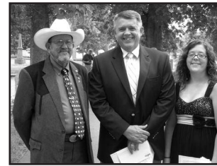
Dickinson and Jackson descendants attend the Dickinson dedication ceremony

The details of the argument vary with the storyteller, but it seems that Jackson took offense at an insult (directed at his wife, his horse, or his integrity) uttered by Joseph Erwin, the father of Dickinson's wife. Dickinson, who some think may have