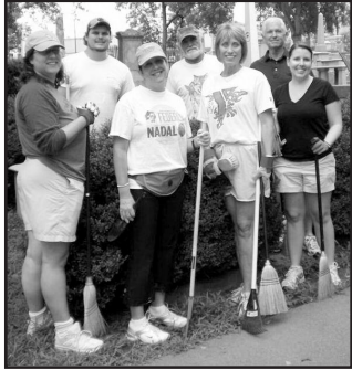
Hands On Nashville volunteers have been instrumental in helping maintain the cemetery grounds.