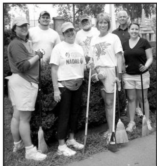
Hands On Nashville volunteers have been instrumental in helping maintain the cemetery grounds.