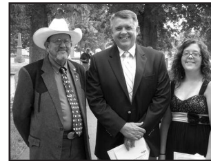
Dickinson and Jackson descendants attend the Dickinson dedication ceremony