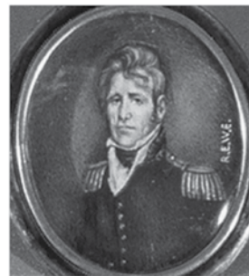
Andrew Jackson miniature, Tennessee State Museum

The tour is not to be missed, as we partner with The Hermitage to highlight arguably the most famous Nashvillian of all time, Andrew Jackson. This year's theme will be Andrew Jackson's Friends and a Few Foes . It will highlight people buried at City Cemetery who shared their lives with Andrew Jackson and his wife, Rachel. As an added bonus, the tour will also commemorate the 200th anniversary of the Battle of New Orleans. "Many people don't realize that the Nashville City Cemetery is the final resting place for many veterans of the War of 1812," says