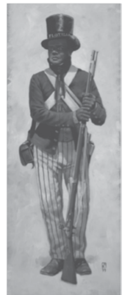
War of 1812 African American soldier