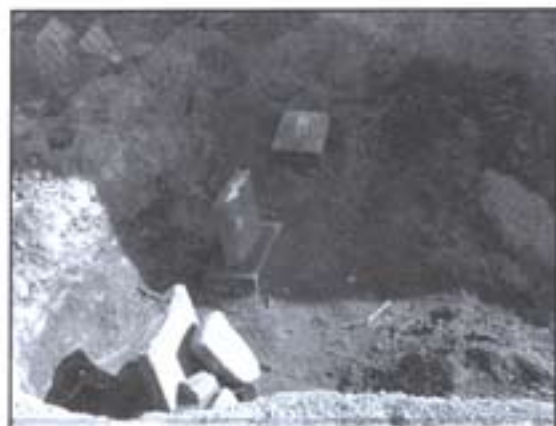
The three Parker Family plot tombstones after being uncovered by Metro Water Department workers.

Metro Historical Commission is currently working to put up a new fence that should be in place this summer and will sit on the true property line. A new fence will be placed along the railroad tracks. The existing chain link fence, along the side property, will be replaced with a new fence. All of