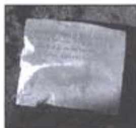
An inscription is still visible on one of the Parker family gravestones.