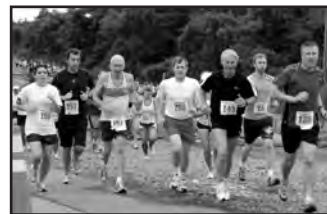
Runners of all ages and abilities come out for the Memorial Day Dash.

We are grateful for the assistance of the Nashville Striders, who partner with the NCCA for this event. Free T-shirts for all runners, with food, awards, and door prizes at the finish. There are eighty veterans buried in the City Cemetery – soldiers from the American Revolution, the War of 1812, the Mexican War, the Civil War, and the two World Wars. This is the second year the Nashville City Cemetery Association has placed flags of remembrance on the graves of our fallen soldiers. Watch the NCCA website for further information ( www.thenashvillecitycemetery.org ).