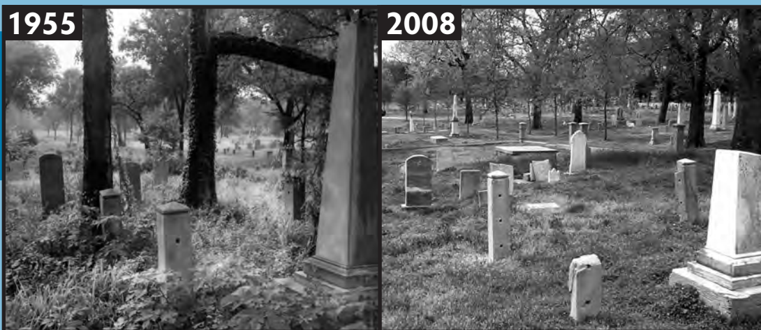
1955: Fallen trees and overgrown weeds made City Cemetery a sad and unwelcoming place in 1955.

From the Nashville Room photo archives at the Nashville Public Library, a glimpse of the City Cemetery from the past and how it appears today.