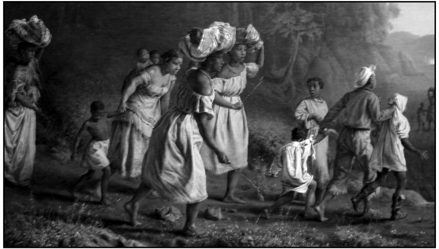
On To Liberty, 1867, Theodor Kaufman, Metropolitan Museum of Art

5th Step: Return to the Interments page. At the bottom of the page, type in "Angeline" and click "Search." The page that opens will list African American interments. The list showing all of the burials between 1846 and 1979