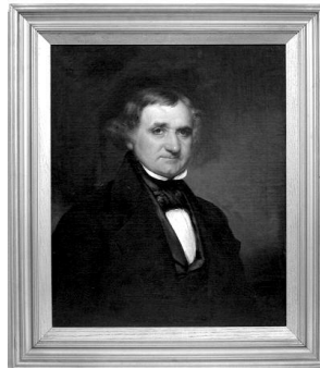
John C. Catron by Chester Harding