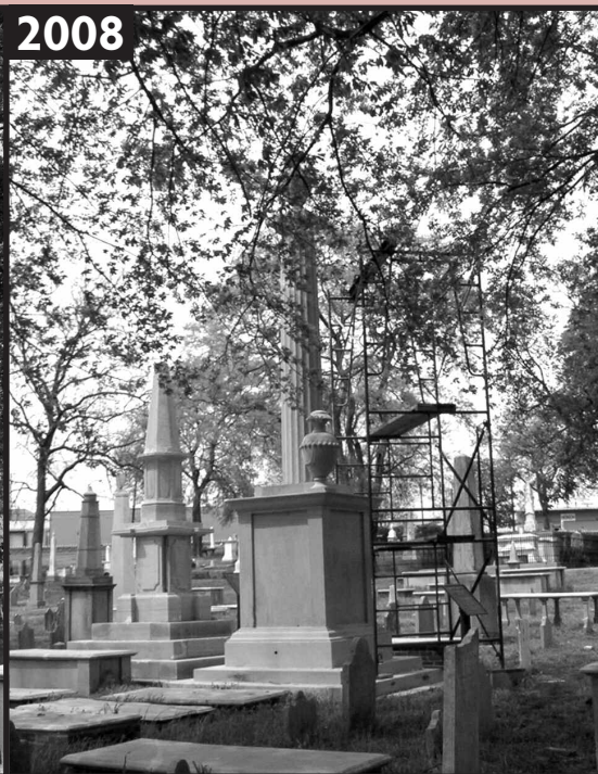
As one of the monuments currently under restoration, plans include replication of the three missing urns.